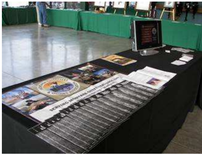
MOGA table ready for banquet participants