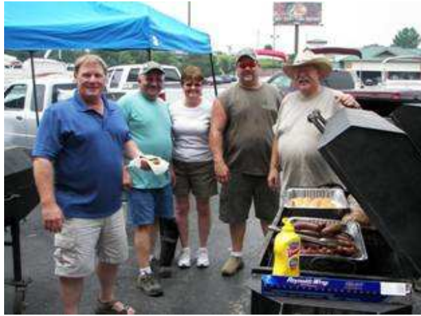
Mac takes a break to check out the banquet cooks, lunch and dinner where as good as it gets!